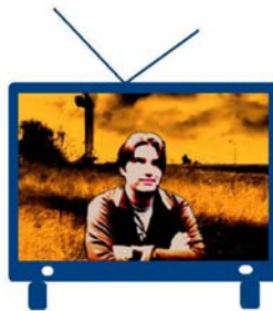
CLiC: Converging Literacies Center